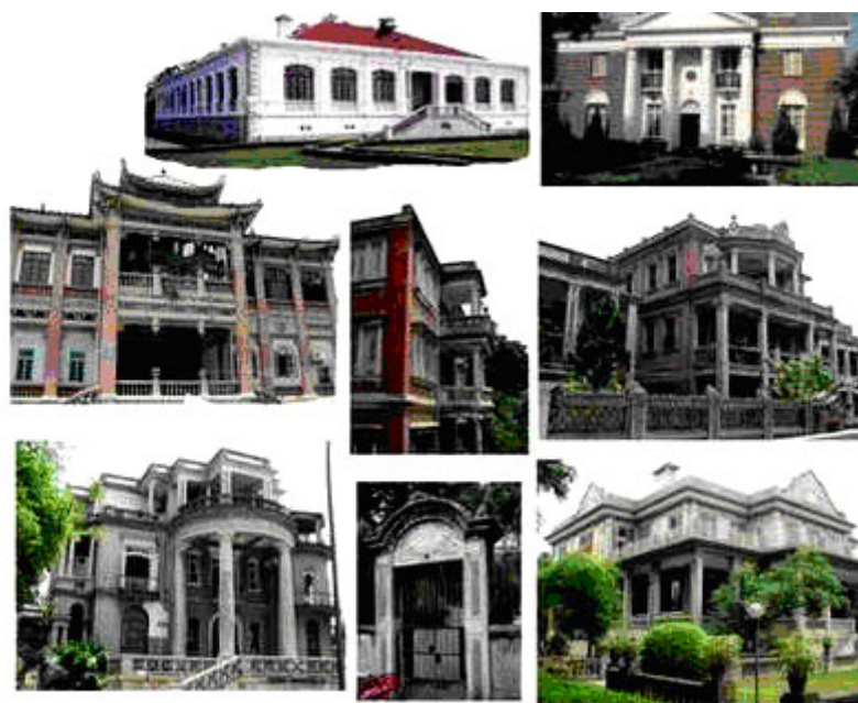
different architectural styles

With a long and multicultural past, Gulangyu also nicknamed " Museum of International Architecture ," is a special testimony of various styles of Chinese and Western architectures. From the baroque building to the Gothic cathedral, from the Shanghai-style alley to the Fujian-style courtyard, Gulangyu is filled with different architectural styles. That's why it is often described as a showcase island of architecture, attracting architecture students from across the nation and the world every year to find their source of inspiration.