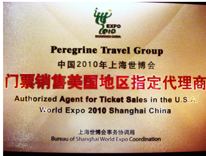
World Expo Certificate