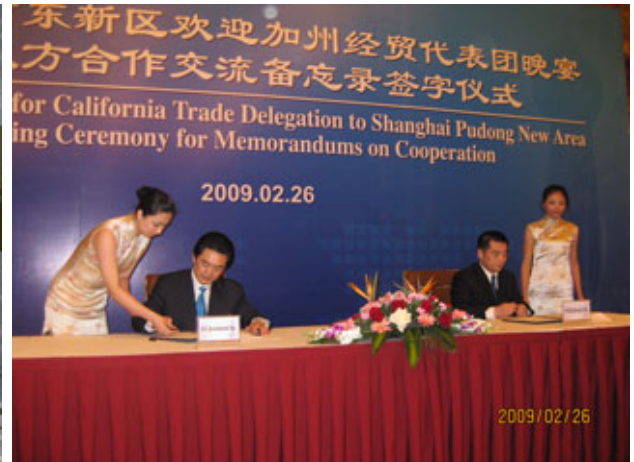
Signing Ceremony with Zhangjiang Group