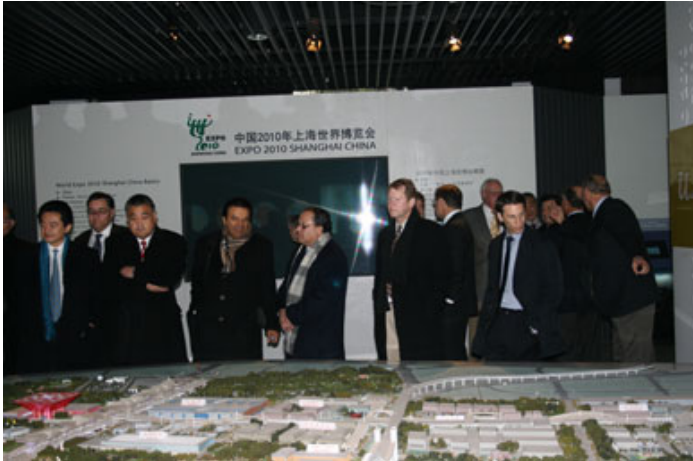
Visit to World Expo 2010 Site