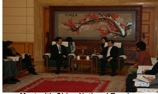
Meet with China National Tourism Administration