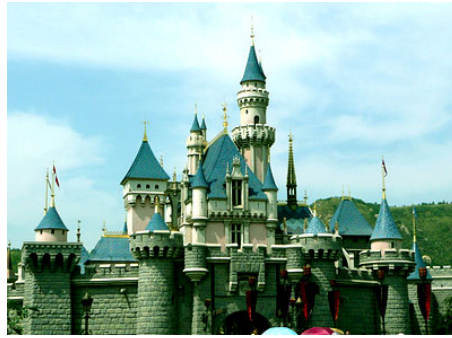
Hong Kong Disneyland