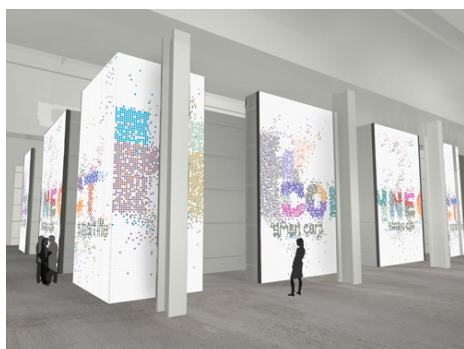
exterior exhibition structure