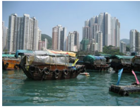
Aberdeen Fishing Village