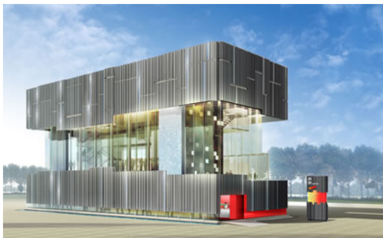
Hong Kong Pavilion