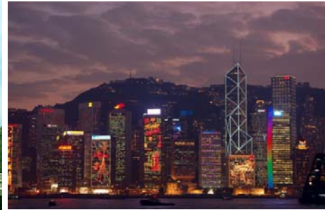
Hong Kong Christmas Lights

Peregrine Travel is proud to present our 2010 World Expo Tour Packages