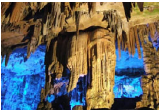
Reed Flute Cave

Reed Flute Cave (Ludi Yan) contains some of the most extraordinary underground scenery in all of China. It's located on the northwest outskirts of Guilin, 5 kilometers away from the downtown area. The natural rock formations in the cave make up several scenes including "Primitive Forest", "Crystal Palace", and "Flower and Fruit Mountain". The multi-colored lighting in the caves adds an extra effect to the already impressive rock formations. About 2 kilometers (1.24 miles) from Elephant Trunk Hill and above the western bank of Li River Scenery, there towers Fubo Hill, another of Guilin's wonderfully scenic spots. It reaches the height of 213 meters (698.8 feet) and emerges 62 meters (203.4 feet) above the water. Half of it stands in the river and the other half of it on land. Since the galloping water is always blocked here and eddied, the hill is considered to have the power of subduing waves. Moreover, it was on this hill that a temple in commemoration of General Fubo was built in the Tang Dynasty (618-907), which gave rise to the name Fubo Hill.