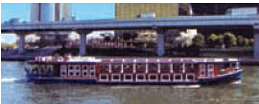
SUMIDA RIVER CRUISE