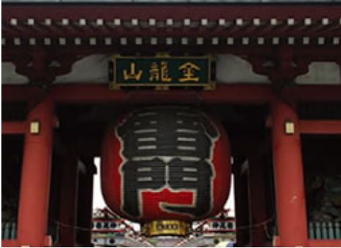
ASAKUSA KANNON TEMPLE