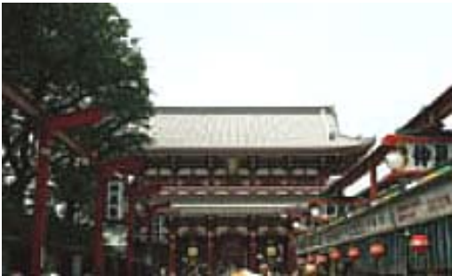
NAKAMISE SHOPPING STREET