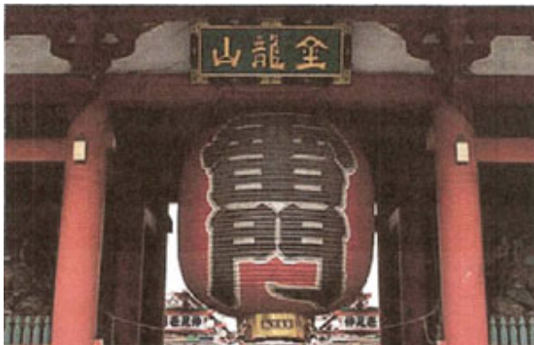
ASAKUSA KANNON TEMPLE